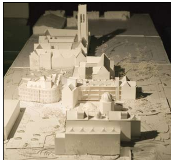
PICTURE IT: This model by Munger, Munger + Associates Architects Inc. of Toledo shows how the College of Business Administration’s new Savage & Associates Complex for Business Learning and Engagement would extend north between Gillham Hall and Ritter Planetarium on Main Campus.